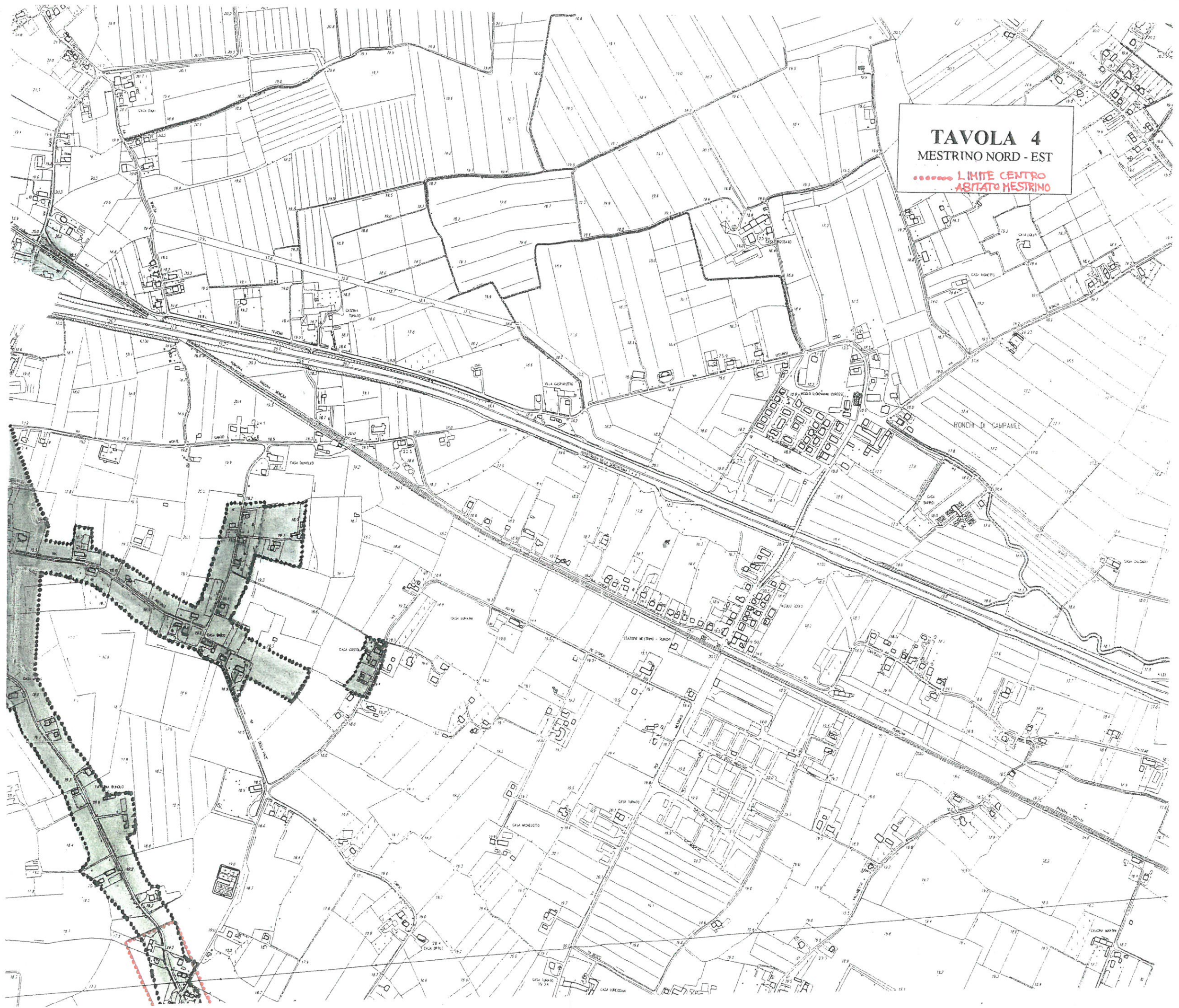
TAVOLA 4 MESTRINO NORD - EST ..... LIMITE CENTRO ABITATO MESTRINO